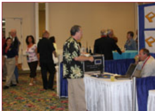
EXHIBIT HALL SPACE IS LIMITED. RESERVE YOUR SPOT TODAY!